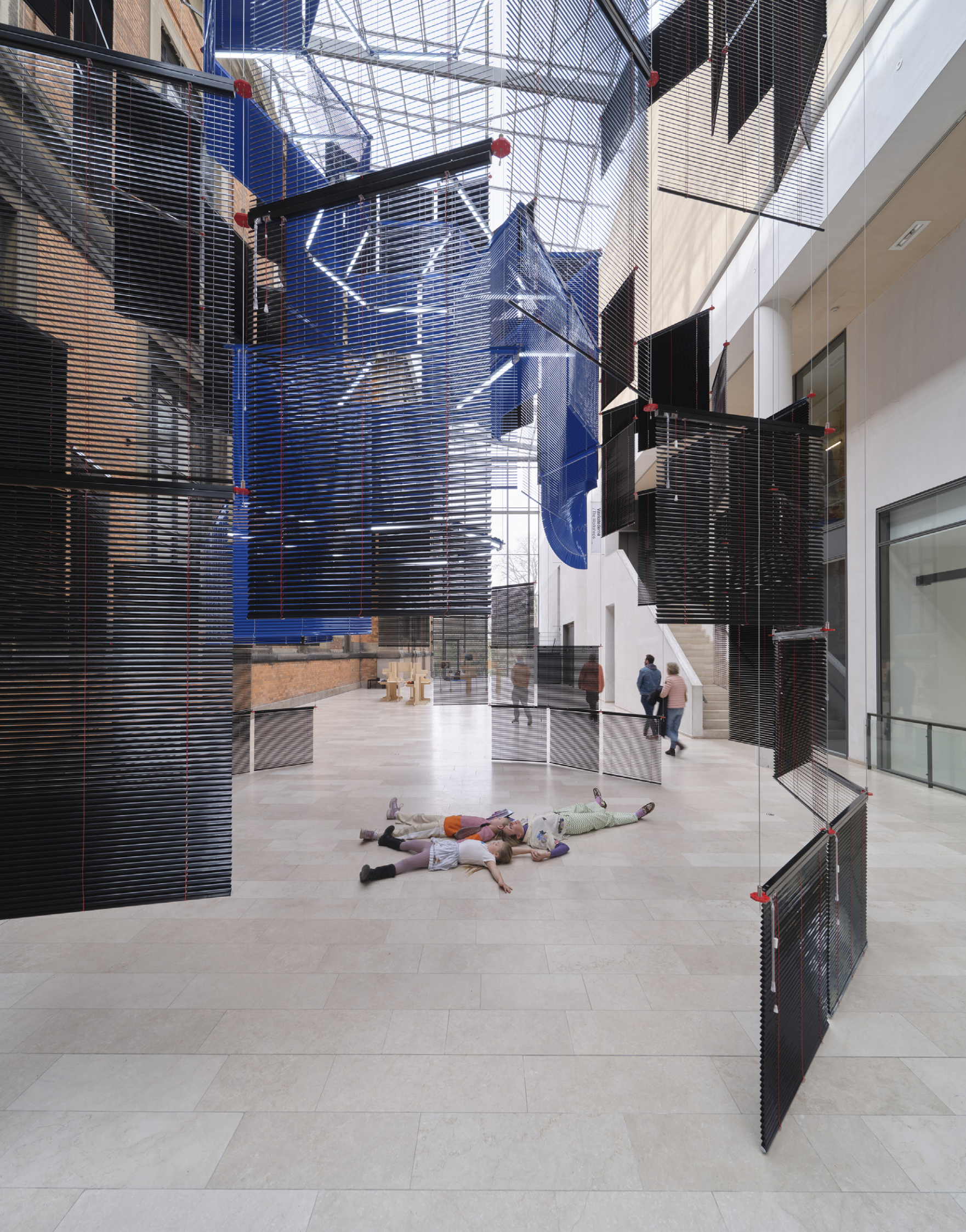
Installation Haegue Yang: Double Soul , Statens Museum for Kunst, Copenhagen, 2022