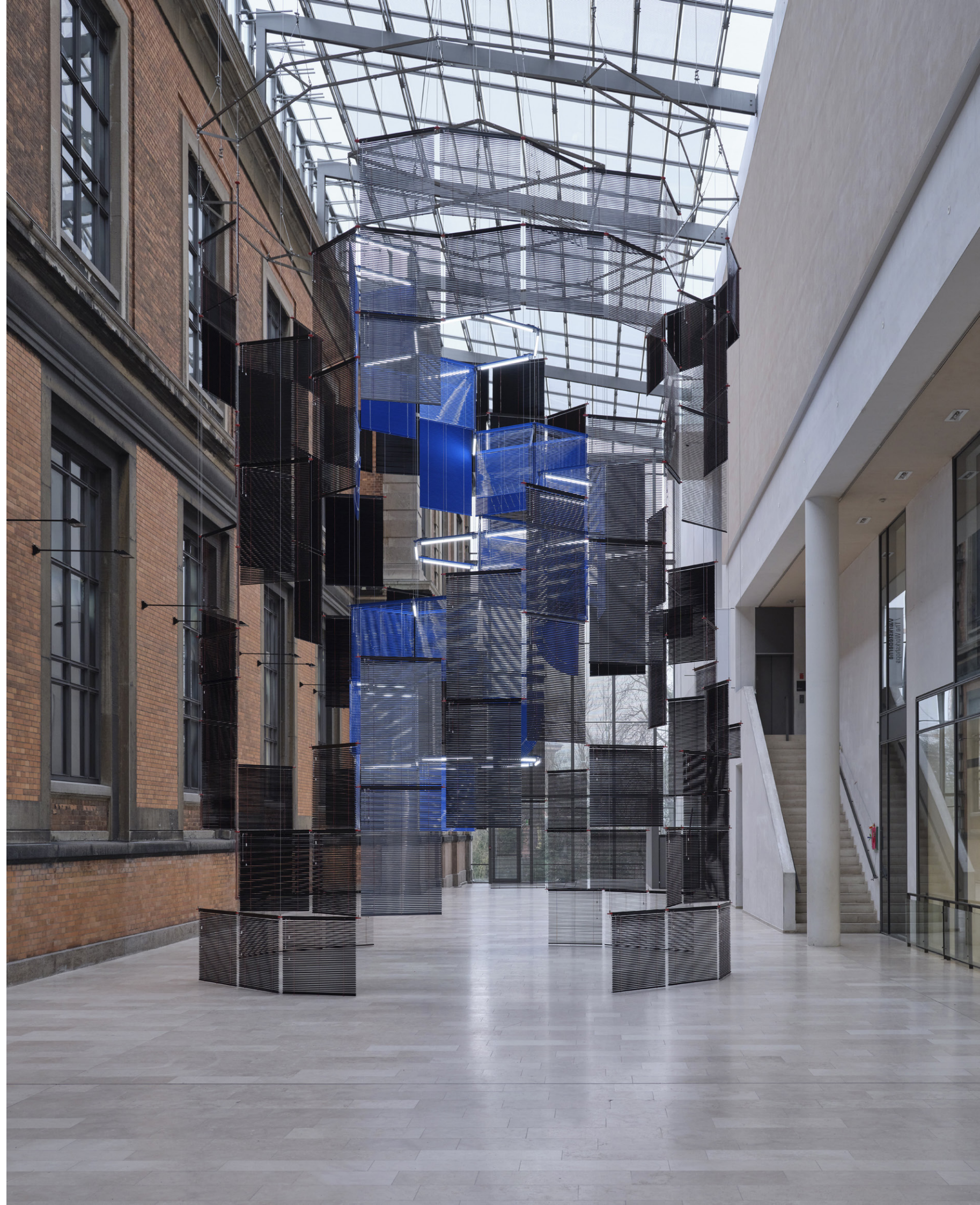
Installation Haegue Yang: Double Soul , Statens Museum for Kunst, Copenhagen, 2022