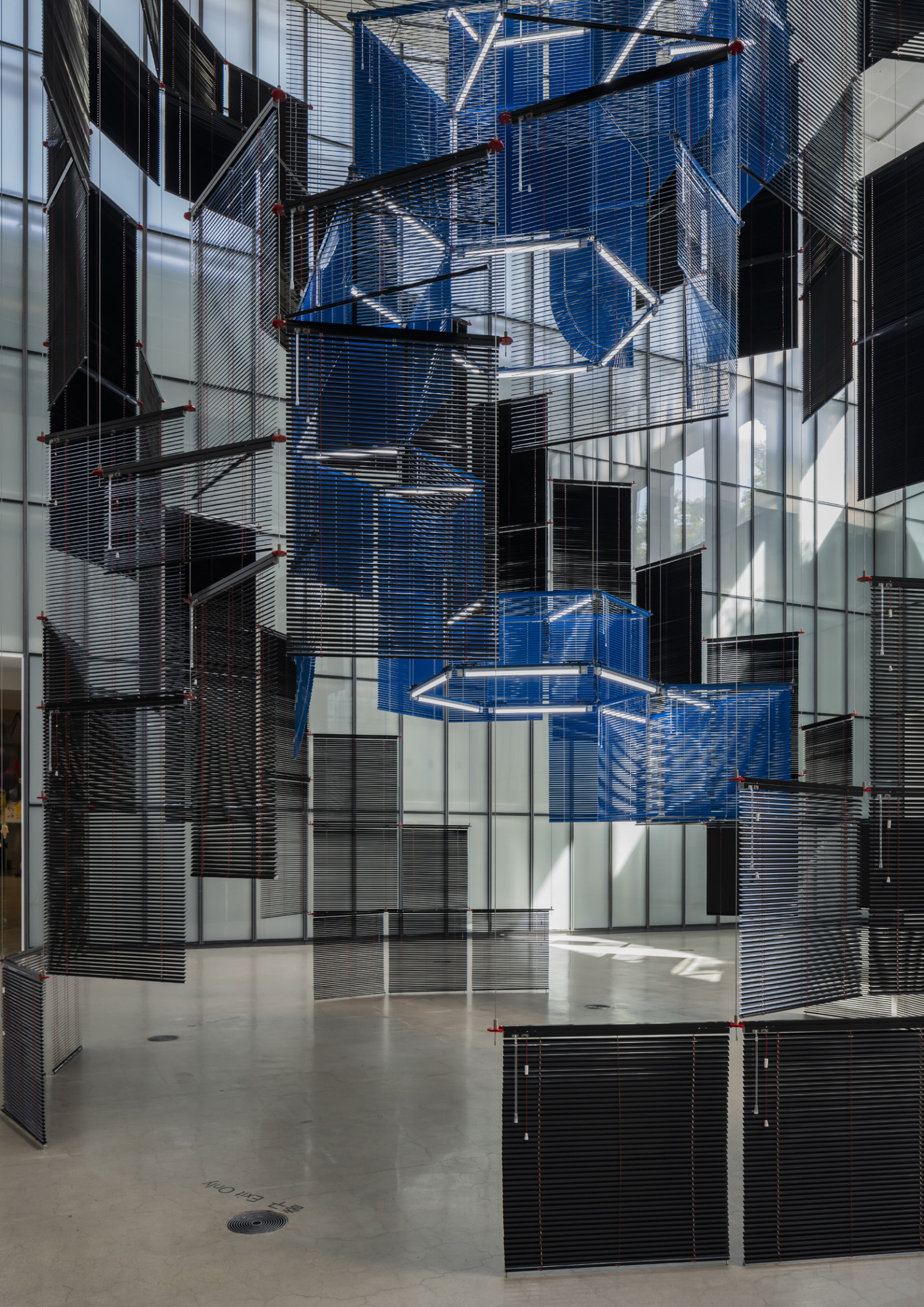
Installation Haegue Yang: O 2 & H 2 O National Museum of Modern and Contemporary Art, Seoul, 2020