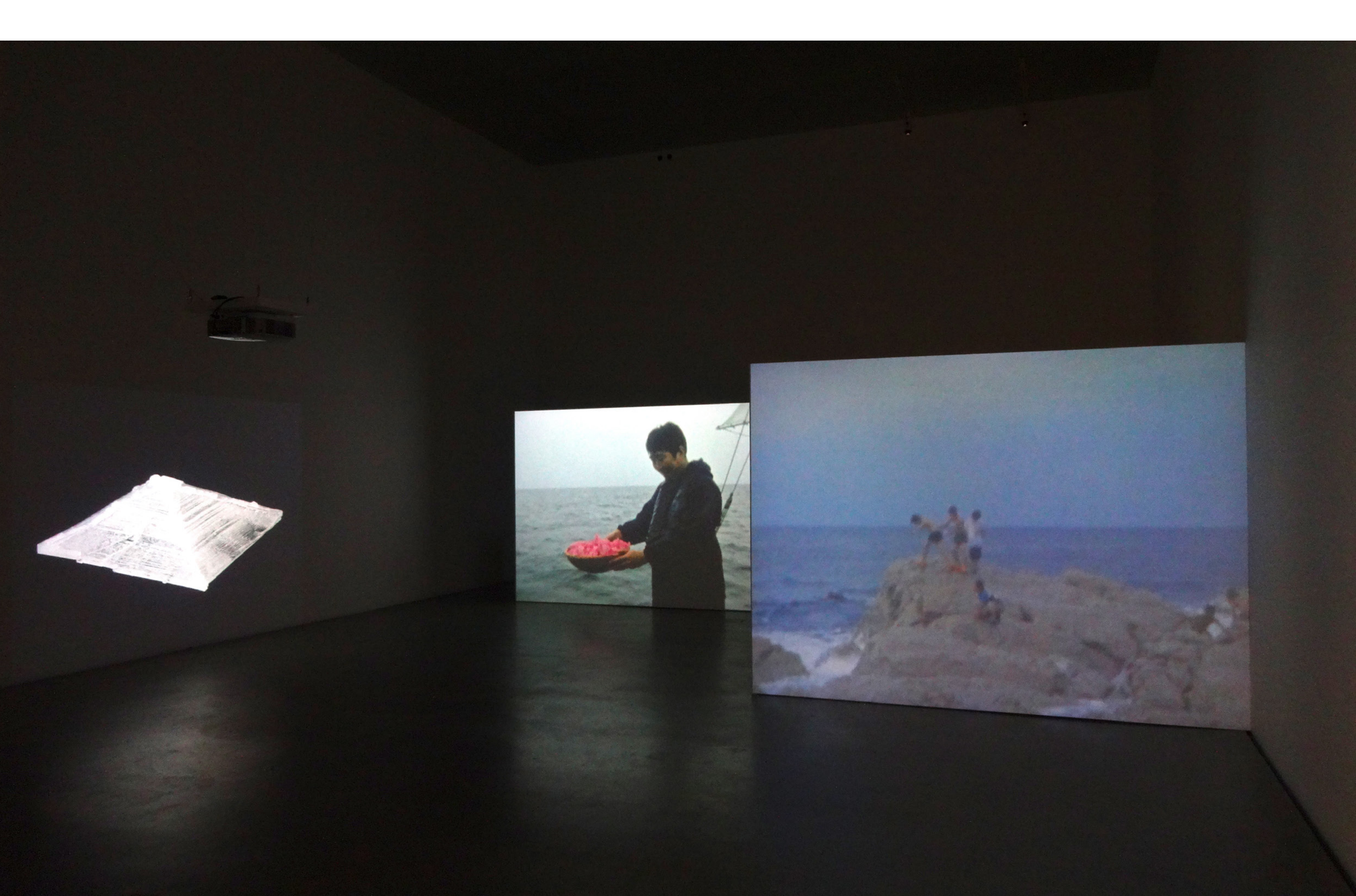
Installation view of Noto at 21st Century Museum of Contemporary Art, Kanazawa, Japan, 2013