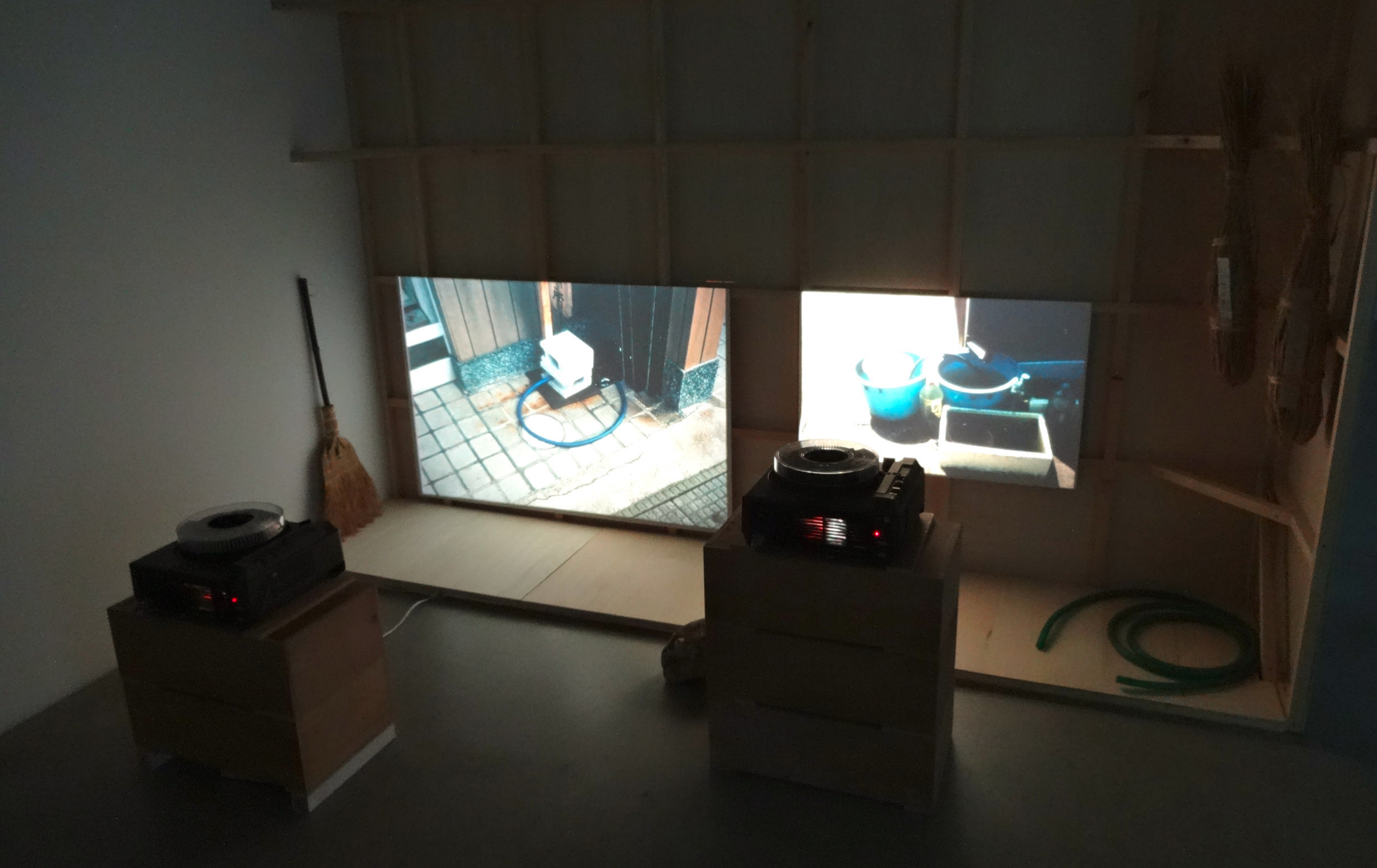
Installation view of Noto at 21st Century Museum of Contemporary Art, Kanazawa, Japan, 2013

+ Some Objects along with “Noto Portrait” and “Back Side of a Wall, a Watermelon and Other Things” Straw Broom, Stone with Shell, Vinyl Hose Unique