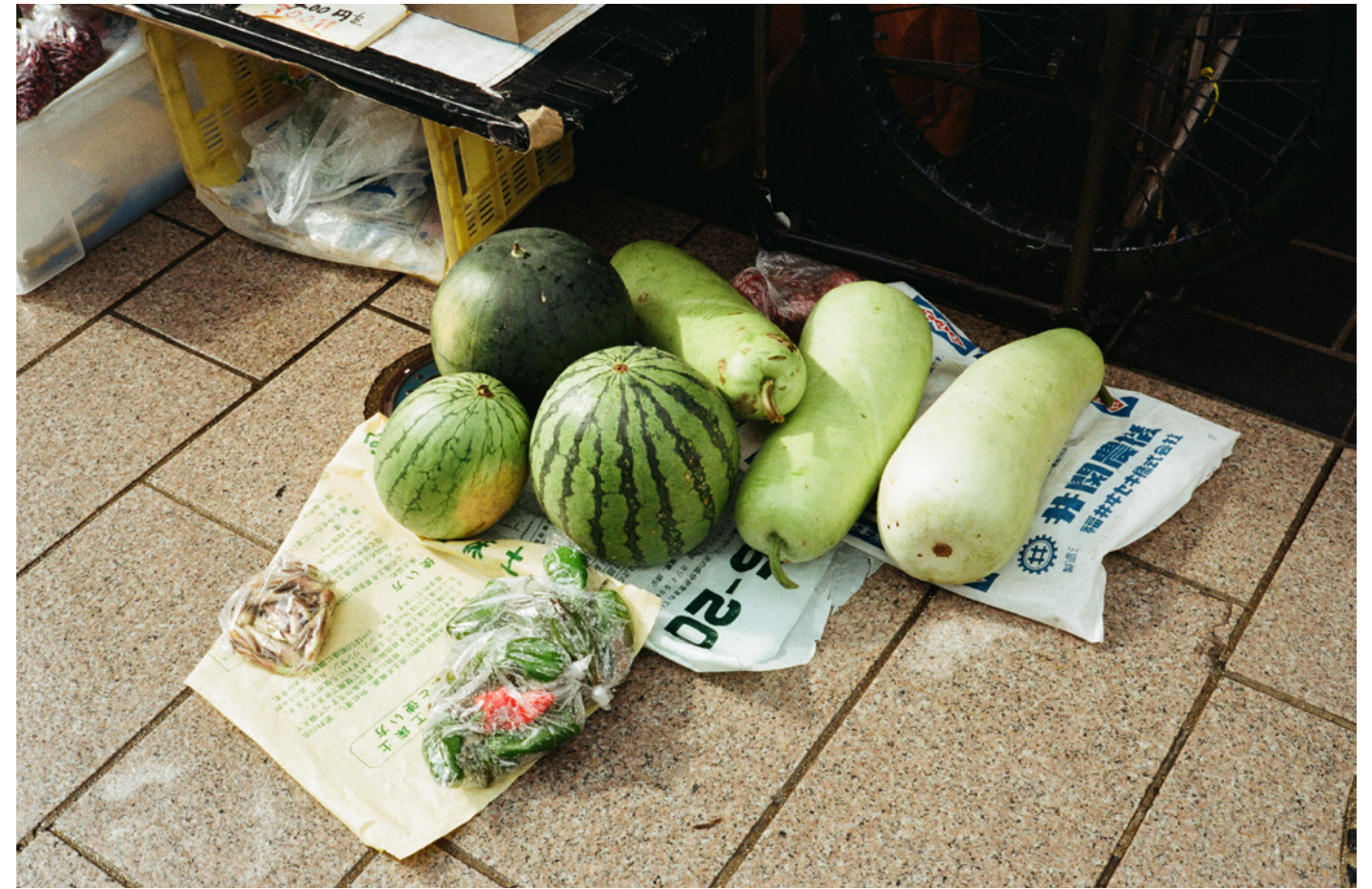
Noto Portrait 2013 35mm Dia Slide Projection (40 images, color) Edition 5 + 2 a.p. (No. 3/5)