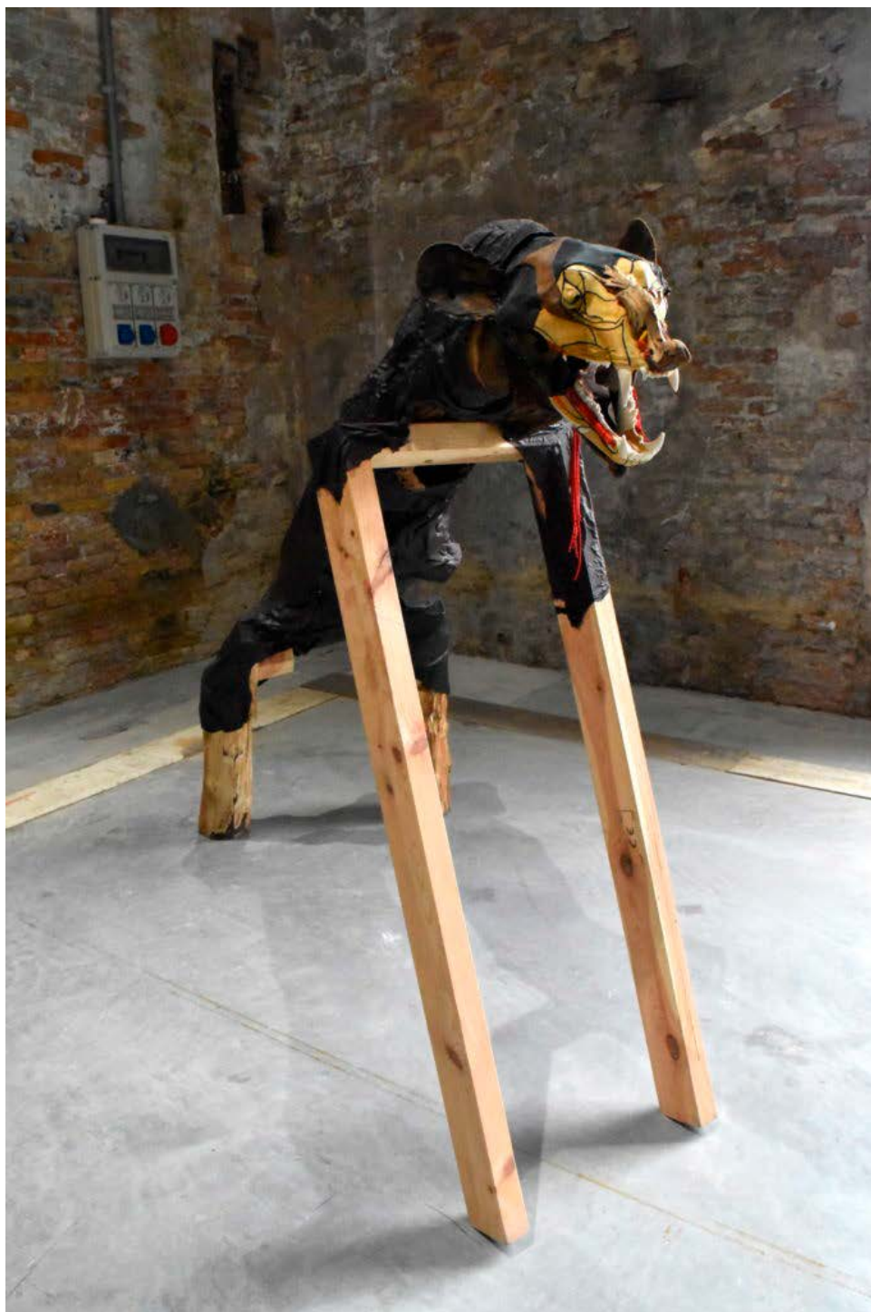
Jimmie Durham, Brown Bear (2017).

He won the Golden Lion for Lifetime Achievement at the 2019 Venice Biennale, having appeared in the exhibition's 1999, 2001, 2003, 2005, and 2013 editions. Durham participated in the 1992 and 2012 Documenta exhibitions in Kassel, Germany, and the 1993, 2003, and 2014 Whitney Biennials in New York.