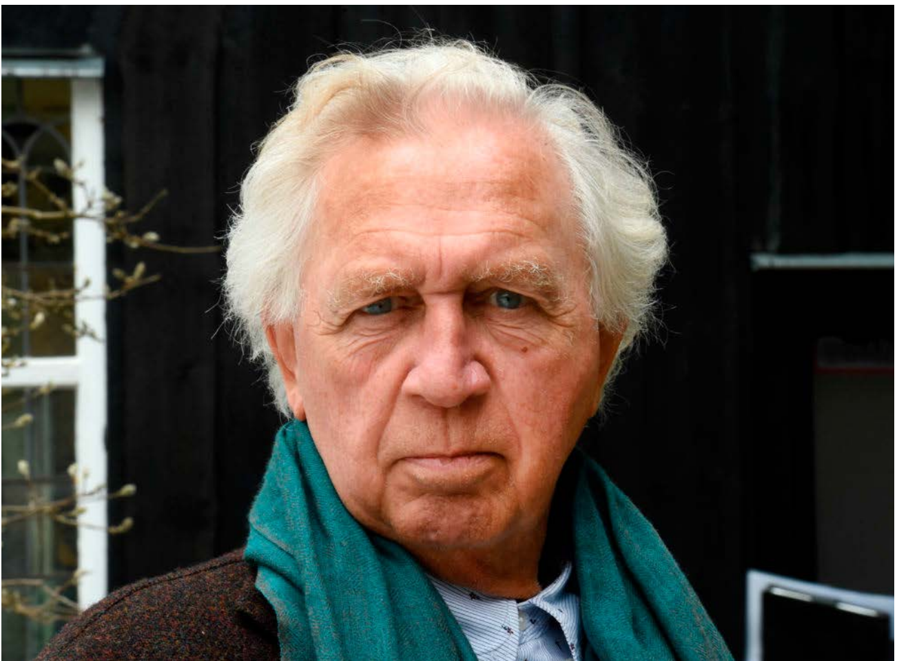
Jimmie Durham in Goslar, Germany.

Jimmie Durham, a performer, sculptor, activist, and writer who resisted easy categorization in both art and life, has died. He was 81.