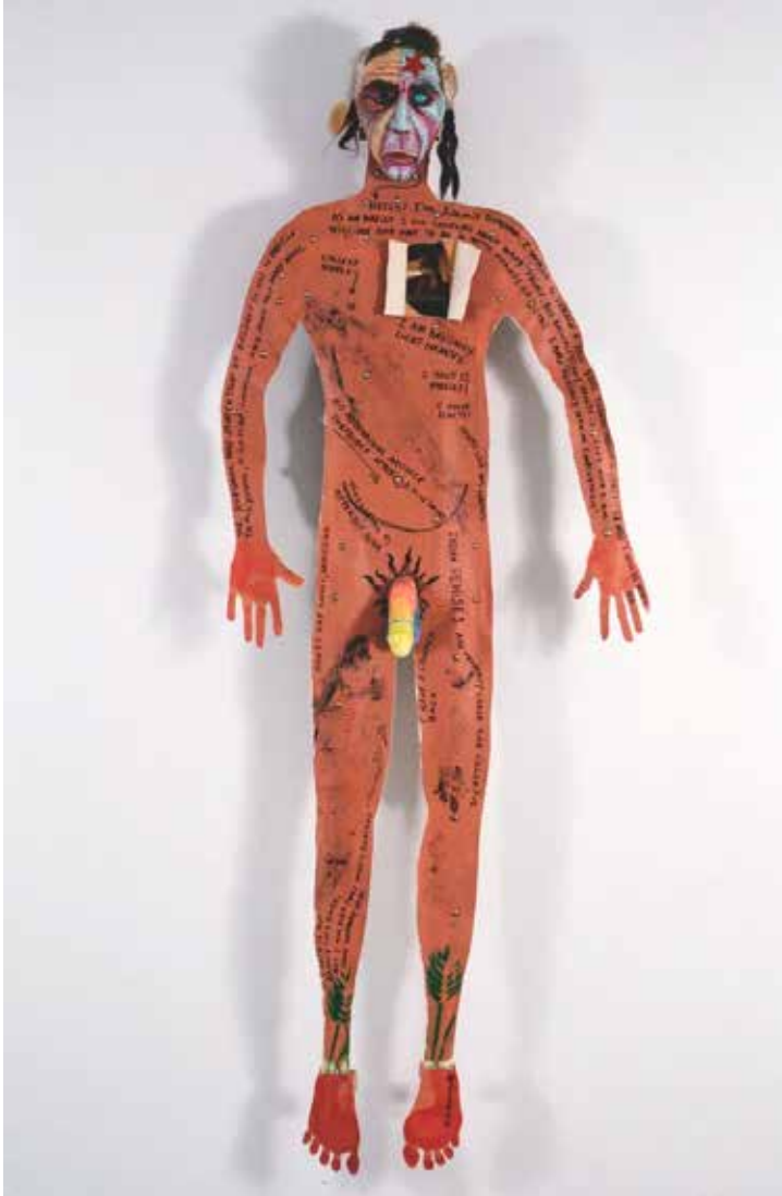
Jimmie Durham, Self-Portrait (1987)