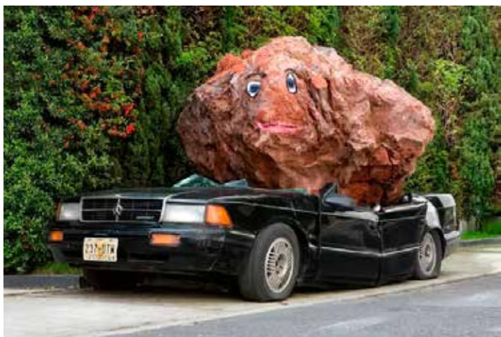
Jimmie Durham, Xitle and Spirit (2007)