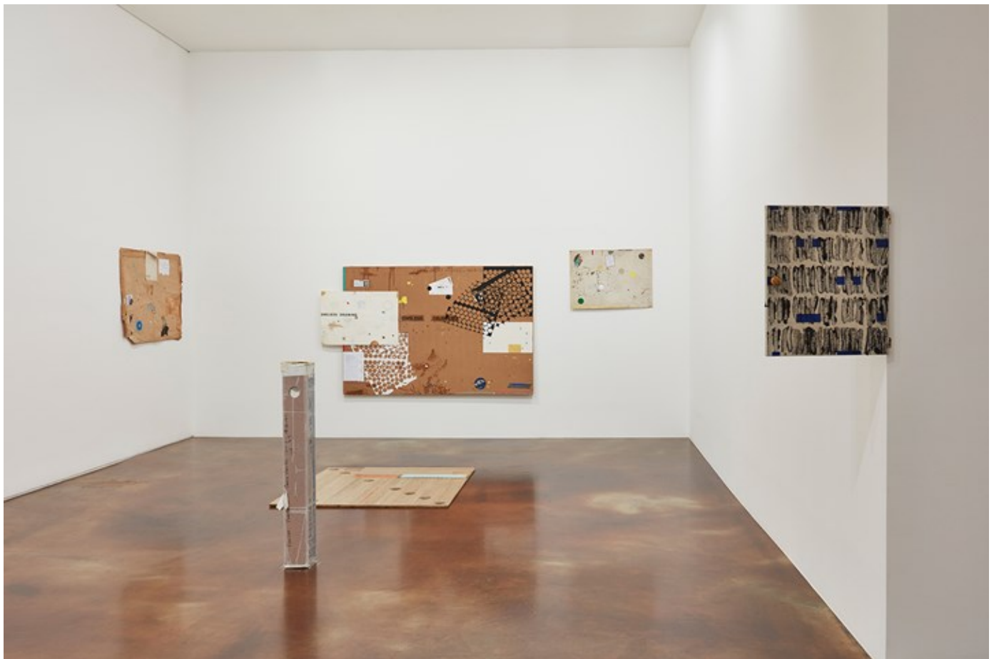
Installation view: Endless Drawing , Kukje Gallery K2, Seoul (20 March–22 April 2018).

At 71, Kim is affable, good-humoured, and generous in conversation. I spoke with the artist at Art Basel in Hong Kong (29–21 March 2018), where Kukje Gallery presented a solo booth of the artist's work as part of the fair's Kabinett sector.