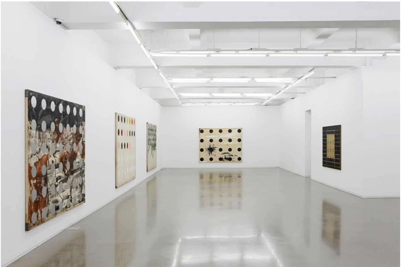
Installation view: Closer... Come Closer... , Ilmin Museum of Art, Seoul (1 September–6 November 2016).

In the 1980s, I moved from the 'Plane Object' series to more abstract and geometric languages. I made some wooden panel pieces that mimicked the drawings. While I was working on that, I tried to create some damages to these pieces by cutting holes in them. A circle is very easy to cut.