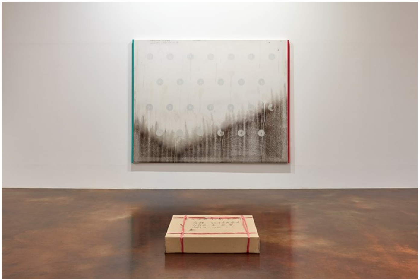
Kim Yong-Ik, Eco Anarchism Project 1 (2017–2018). Mixed media on canvas. 181 x 232.5 cm; Untitled (Dedicated to 1981 'Today's Circumstance') (2010). Second version, after lost original of 1981. Ink, packing strap, box. 15 x 81 x 80 cm. Installation view: Endless Drawing , Kukje Gallery K2, Seoul (20 March–22 April 2018). Courtesy the artist and Kukje Gallery. Photo: Keith Park.

It arises from the fine line between art and everyday reality. I'm constantly thinking: 'I'm an artist, do I want to be an artist, this is an artwork but this doesn't want to be an artwork.' How do I rectify that? The term is a combination of different philosophical ideas and is not a word that I've created myself, but I adopted the term to explain my idea of how an artwork should embrace damage and be open to change. The artist should be allowed to destroy the work if he wants to embrace dirt and time. I'm very keen on humble objects and I wish to have my works open.