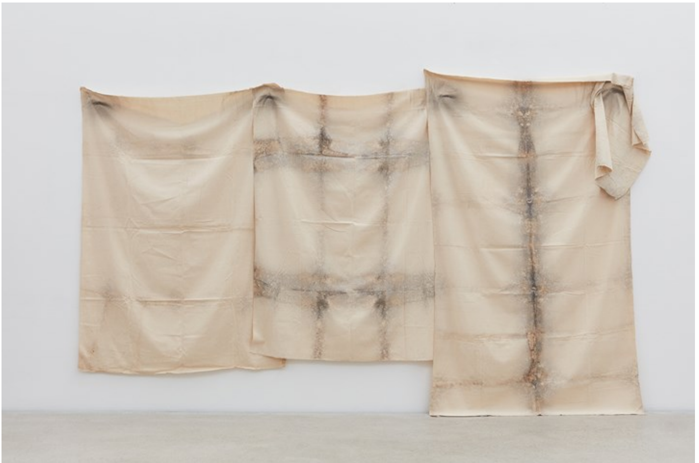
Kim Yong-ik, Plane Object (1977). Airbrush paint on cloth. Approximately 200 x 370 cm. Courtesy the artist and Kukje Gallery. Photo: Keith Park.

Born in 1947 in Seoul, he conceived of formative 'Plane Object' series (1975–1981) while he was still an undergraduate at Hongik University, where he graduated with a BFA and MFA in painting in 1980. 'Plane Object' comprises wrinkled, washy and airbrushed unstretched canvases, hung directly on the wall and lightly painted to give the illusion of depth and folds. Kim quickly became known for these illusory works; but, uncomfortable with the trappings of the mainstream art world that came along with recognition, he periodically stopped working on the project in 1981. He began depicting repeated and perfectly aligned polka dots on mostly-plain backgrounds in the early 1990s. Yet in defiance of precision, Kim deliberately blemished the canvases by smearing them with dirt, vegetable juices and other substances, even circling and annotating the imperfections with pencil to draw the viewer's attention to the 'mistakes'. This intentional ruination has been a consistent theme throughout his practice; Kim is none too precious about his work. He is known for intentionally contaminating or soiling his canvases and sometimes leaving them outside to amass mould, all to the ends of what he calls 'eco-anarchism', or the embracing of decay and cheap materials to minimise waste.