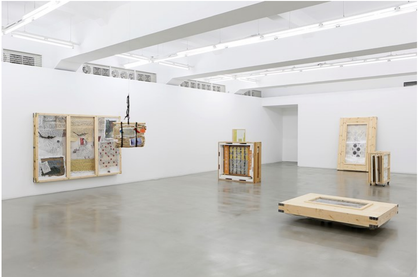
Installation view: Closer... Come Closer... , Ilmin Museum of Art, Seoul (1 September–6 November 2016).

I titled those paintings from the 1990s 'Closer, Come Closer'. From a distance, they look like modernist paintings. But if you come closer, you can see little marks, cracks and even where I sometimes stick my hair on the surface.