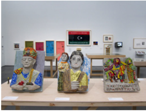
Installation view of 'Michael Rakowitz: Backstroke of the West' at MCA Chicago