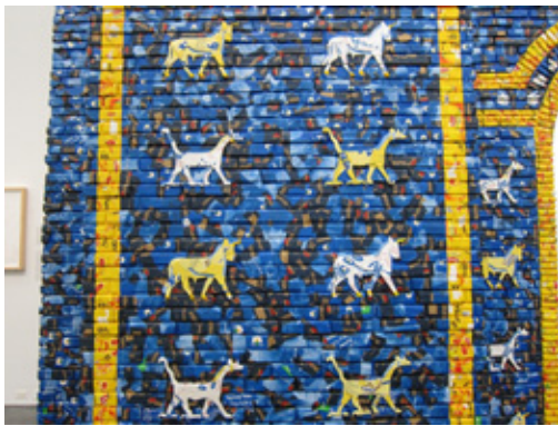
Michael Rakowitz, detail of "May the Arrogant Not Prevail" (2010)

Organized by curator Omar Kholeif, the exhibition includes Rakowitz's ongoing series, The invisible enemy should not exist , for which the artist and his assistants are fabricating artifacts looted from the Iraqi National Museum in 2003. Each sculpture is made of found detritus such as newspaper and food packaging — material that speaks to an urgency to replace objects that are lost, invisible, even, having been stripped of provenance and placed on the black market. Yet, they assert that history cannot be completely remade. They stand as tragic effigies of treasures forever gone, similar to Rakowitz's reconstruction of the Ishtar Gate that stands at the exhibition's entrance, made of plywood and plaster. More accurately, his wooden gate is an imitation of the crude replica that stands in Babylon, commissioned by Saddam Hussein to replace the original — which, again, cannot truly be recreated.