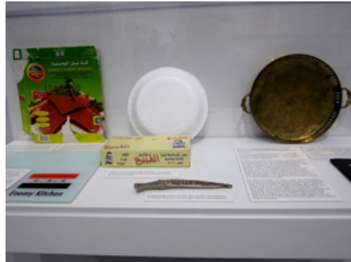
Installation view of 'Michael Rakowitz: Backstroke of the West' at MCA Chicago