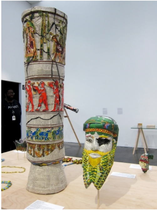
Works from "The invisible enemy should not exist" (2007-ongoing)

from a war-damaged industry, represented environmental victims that were literally caught up in the same traffic as refugees; they were, like humans forced to move their lives, trapped in unfeasible transactions.