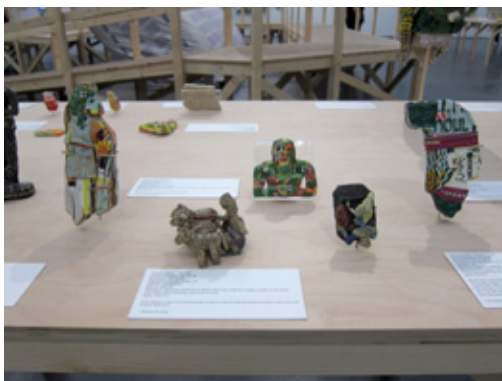
Installation view of 'Michael Rakowitz: Backstroke of the West' at MCA Chicago