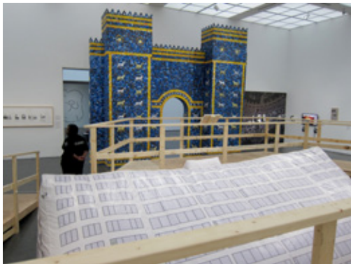
Installation view of 'Michael Rakowitz: Backstroke of the West' at the Museum of Contemporary Art, Chicago

CHICAGO — In 2006, the artist Michael Rakowitz took on a complicated, seemingly impossible task. He opened a store in Brooklyn to sell dates, with the chief goal of importing the sweet fruit directly from Iraq, and packaged in boxes that advertised their true origin. Some Iraqi companies had successfully circumvented the United Nations-imposed sanctions and smuggled date syrup out of their country, but the labels of their final products on the shelves