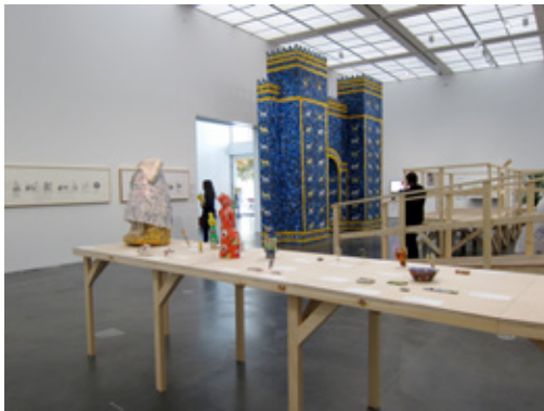
Installation view of 'Michael Rakowitz: Backstroke of the West' at MCA Chicago