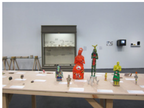
Installation view of 'Michael Rakowitz: Backstroke of the West' at MCA Chicago