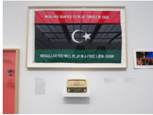
Installation view of 'Michael Rakowitz: Backstroke of the West' at MCA Chicago