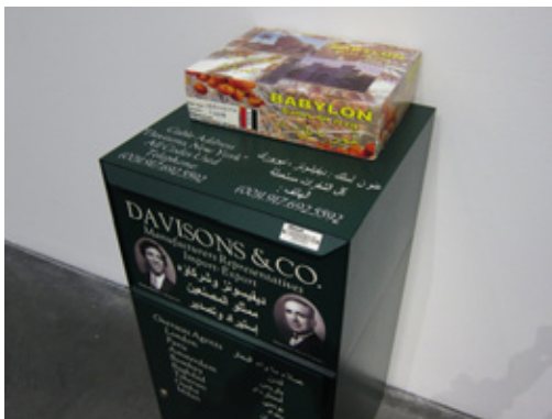
Installation view of 'Michael Rakowitz: Backstroke of the West' at MCA Chicago

These are clear patterns one sees in Backstroke of the West , Rakowitz's first museum survey currently on view at the Museum of Contemporary Art, Chicago. Its title alone alludes to Rakowitz's interest in veiled or misunderstood meanings, standing as a machine's mistranslation of the film title, Revenge of the Sith .