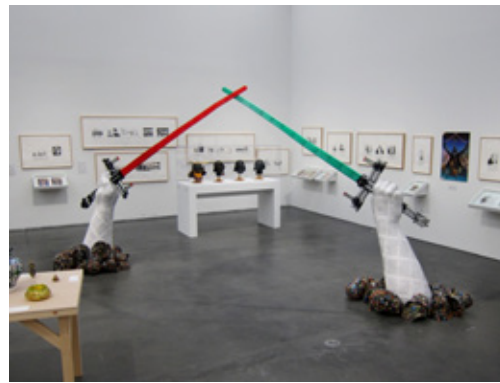
Installation view of 'Michael Rakowitz: Backstroke of the West' at MCA Chicago

Pillaged artifacts can turn up not only on distinguished platforms like Sotheby's but also on eBay , which is where Rakowitz found one of the strangest objects in the exhibition: an Iraqi paramilitary helmet modeled on Darth Vader's ominous headgear. Sold by an American soldier who had found it in Mosul, the helmet was one designed by Uday Hussein, who, it turns out, was a fan of Star Wars , as was his father. It's displayed alongside a Darth Vader helmet, near a sculpture that further