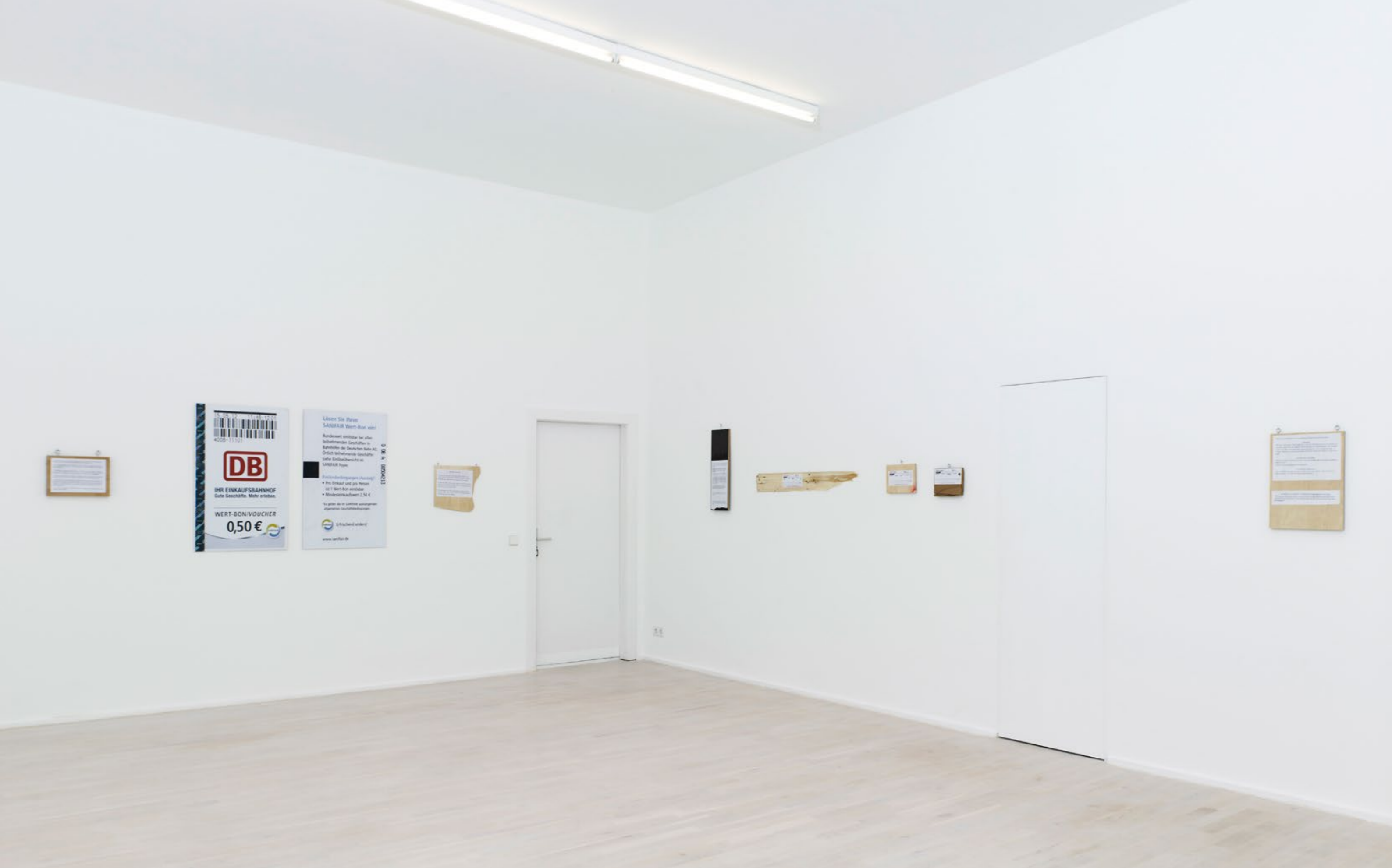
Jimmie Durham's exhibition Too Long and Drawn Out bases on diary-like texts about his occurrences during the last months. Durham travelled to Naples, Rome and Berlin, made a retrospective at MUHKA in Antwerp, an installation at the dOCUMENTA (13) and realised a sculpture on Luis Buñuel at the art fair in Basel.