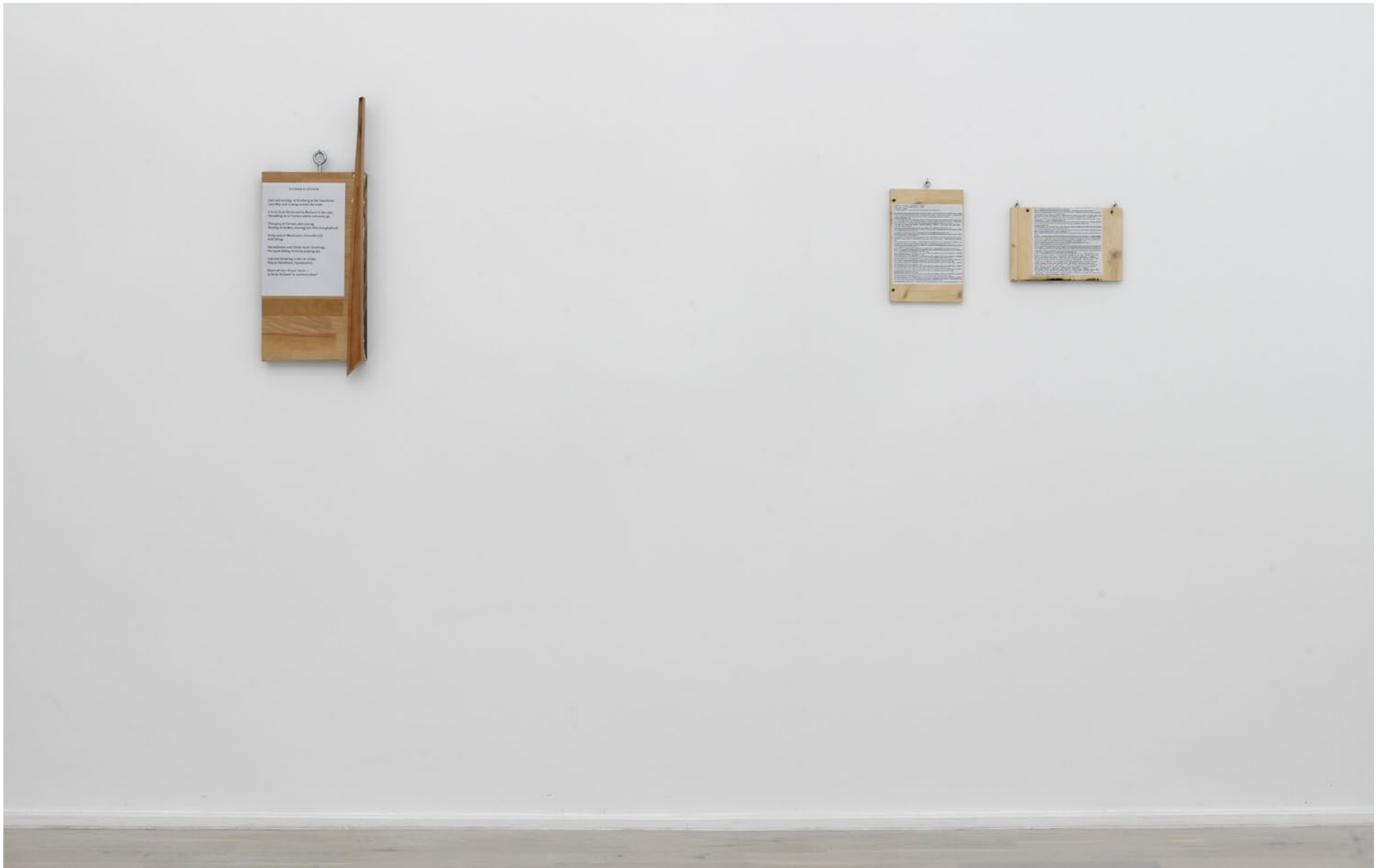
Installation Too Long and Drawn Out Galerie Barbara Wien, Berlin, 2012